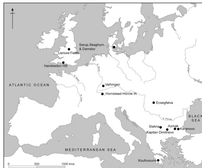
Fig. 2. Map showing the archaeological sites.

Fig. 4 shows \Delta^{13}\text{C} and \delta^{15}\text{N} values of cereals and pulses from four sites, and Table 2 summarizes results from all sites (for individual sample results, see Table S2). Unsurprisingly, a broad climatic trend in humidity is apparent if wheat or barley \Delta^{13}\text{C} values at sites in or near the Mediterranean zone are compared with those in temperate zones (Fig. 2): thus, \Delta^{13}\text{C} values of wheat