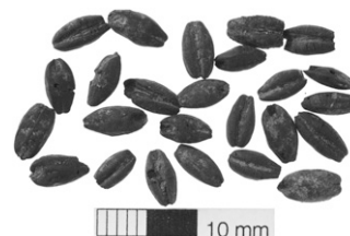
Fig. 3. Neolithic hulled barley grain from Koufovouno.